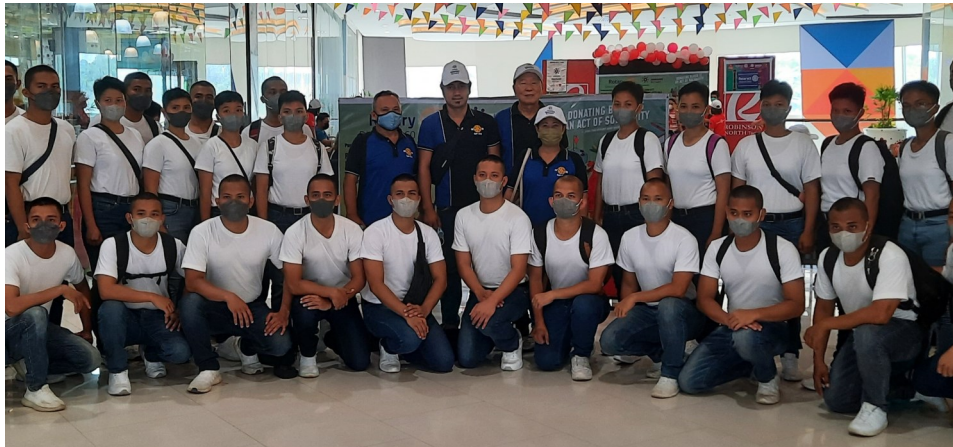
PNP as blood donors during Area 3B 1 & 2 Blood Letting Project at Robinson North, 3rd Floor, July 16, 2022