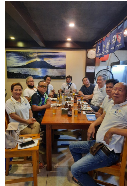
July 14, 2022 Business and Fellowship Meeting at Sakurajima Resto, Phil India, Tacloban City